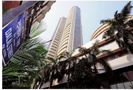
Live: Sensex falls over 100 points ahead of RBI's monetary policy review