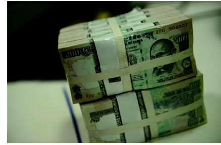
Rupee trades flat at 66.20 against US dollar

HOME | COMPANIES | OPINION | INDUSTRY | POLITICS | CONSUMER |