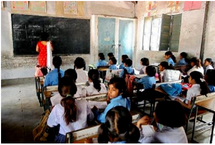
Yes to a government college, but no to government schools